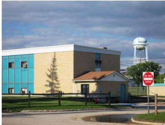
[Turtle Mountain Agency of the BIA, 2007]

protecting water and land rights, developing and maintaining infrastructure and economic development. It oversees about 600 federal employees in the local schools, hospital, road and police departments. (personal communication with Davis 2007)