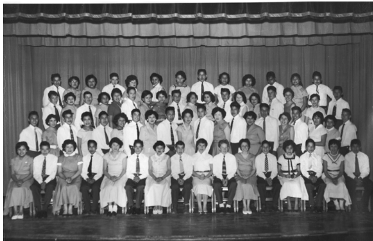
[Wahpeton Indian School Students 1956]

In 1882, a federal act authorized the use of any abandoned military facilities for the education of Indian children. Many Belcourt children were forced into boarding schools at Fort Totten and Wahpeton, North Dakota, and Marty, Flandreau and Pierre, South Dakota, Chemawa, Oregon and boarding schools in other states.