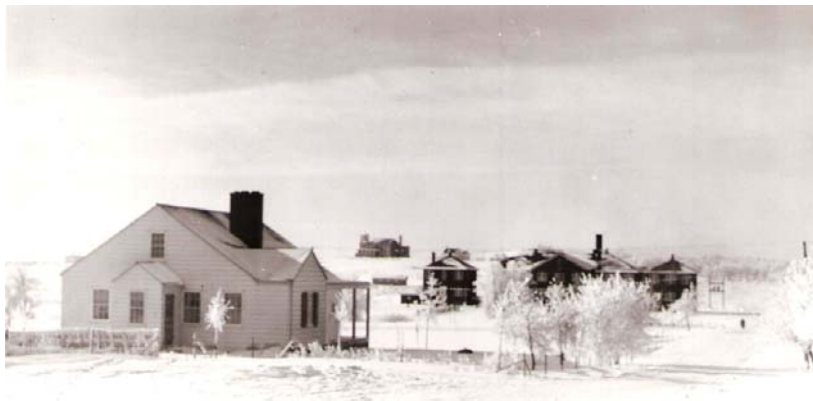
[Turtle Mountain Agency of the BIA, 1938]

The Turtle Mountain Tribe has existed as an autonomous government within the United States because early treaties recognized the Band's sovereignty. The United States government promised "health, education, and welfare" in exchange for aboriginal lands. This unique relationship gives rise to several institutions that manage these services including the Bureau of Indian Affairs and the Indian Health Service. These institutions are the major employers on the reservation, with over 600 teachers, nurses, bus drivers, mechanics, road workers, janitors, cooks, policemen and others.